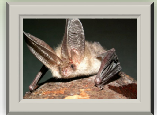
Northern Long Eared Bat