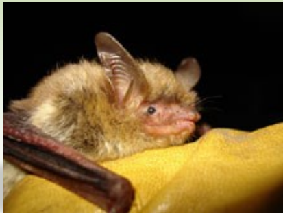
Northern Long Eared Bat

Counties must follow new guidelines as a part of road projects that involve tree cutting or work on bridge decks. Guidelines are different depending on the type of road funds being used.